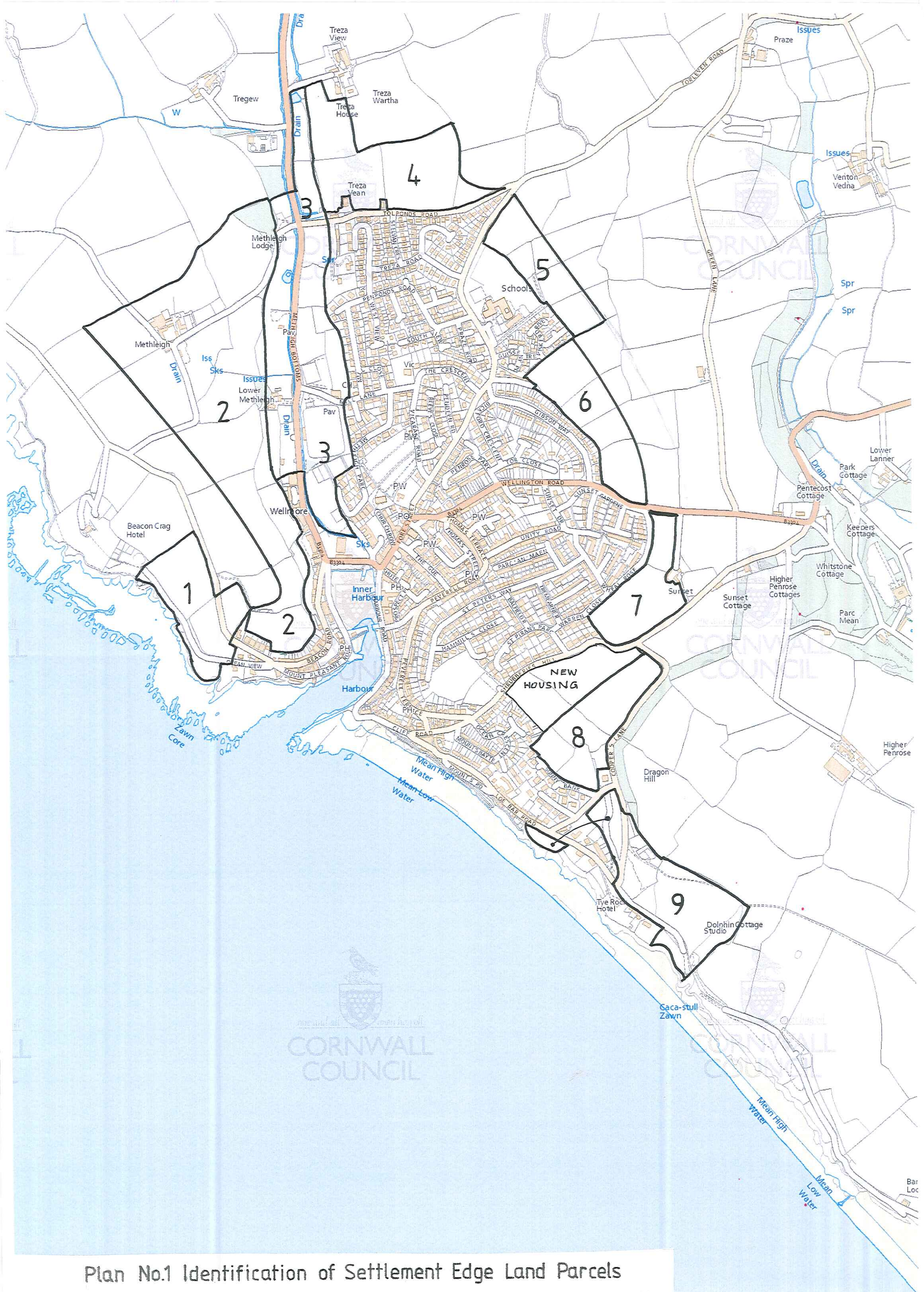
Plan No.1 Identification of Settlement Edge Land Parcels